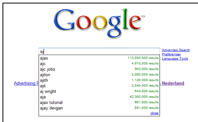
Figure 0-2. Google Suggest uses Ajax to suggest search terms. Google Suggest: http://www.google.com/webhp?complete=1&hl=en

Form validation, for instance checking an email field on the '@' and dot extension, is not real Ajax. No communication takes place. An advanced example of Ajax is Google Suggest. While the user types search keywords, the application contacts Google in the back and requests suggestions. See the example in Fout! Verwijzingsbron niet gevonden.: the user typed 'Aj' and suggestions like 'ajax', 'ajc', 'ajc jobs', 'ajilon' pop up.