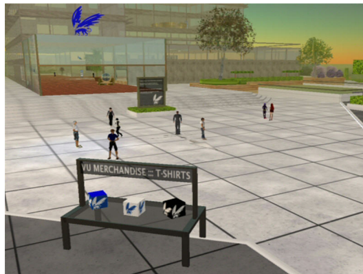
Fig 3. VU @ SL – visitors outside

cf. Zielinski (2006), remains to be seen. Chances are also that Second Life will end up as another item on the dead media projects 21 list, to be replaced by an alternative participatory framework or environment.