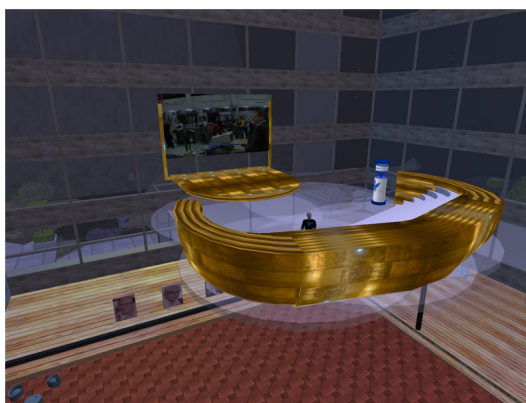
Fig 2. VU Campus – inside view

Two and a half months later, we are online, with a virtual campus, that contains a lecture room, a telehub from which teleports are possible to other places in the building, billboards containing snapshots of our university's website from which the visitors can access the actual website, as well as a botanical garden mimicking the VU Hortus, and even a white-walled experimentation room suggesting a 'real' scientific laboratory. All building and scripting were done by a group of four students, from all faculties involved, with a weekly walkthrough in our 'builders-meeting' to re-assess our goals and solve technical and design issues.